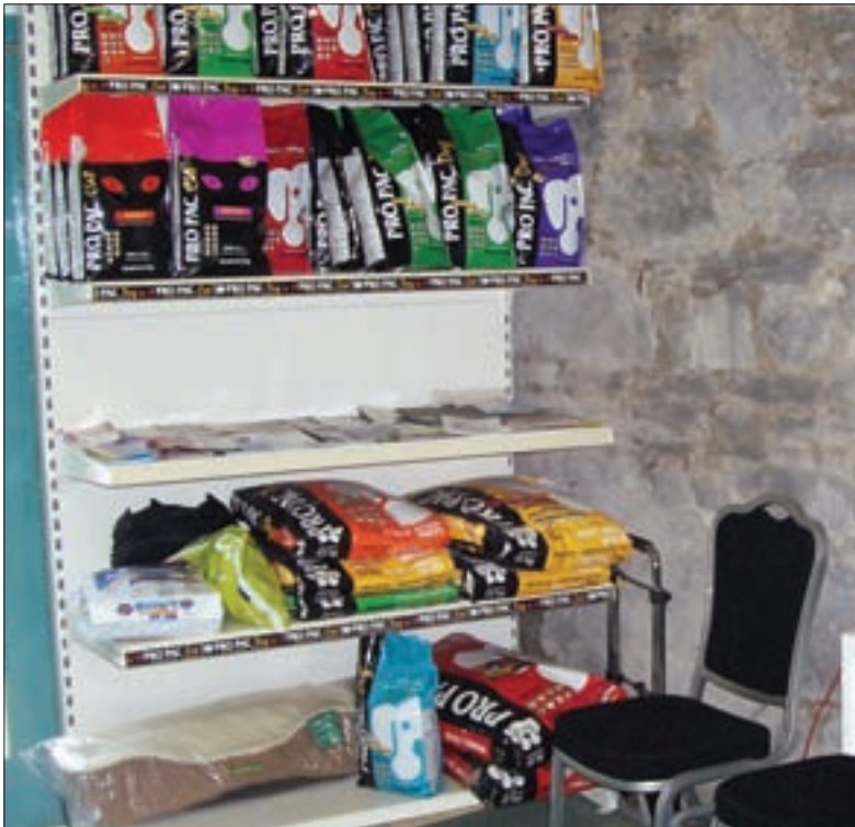
Pictured is the reception/ retail room with part of the original town wall of Athenry.