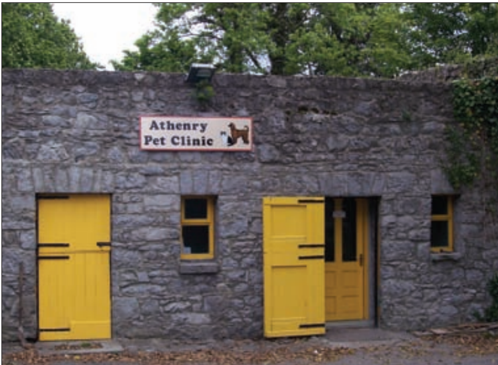
This unique practice is based in a block of converted stone stables almost 200 years old.

As the building is listed we had to ensure that there were no external changes to the building and any work carried out would be done in keeping with the original building. The building was divided internally into three sections – a small animal surgery, an office and an area that housed the stocks for scanning. This division was achieved through the use of stud wall partitions. After discussing the practice's needs and correlating the practice wish list, I set about redesigning the practice layout. By removing some of the internal walls and constructing new ones, it created four good-sized rooms: