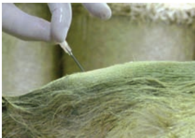
Figure 3: Positioning the needle under the correct angle for injecting.