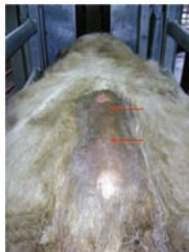
Figure 1: Location of the sites for injection of the epidural anaesthesia.

location for injection. After identification of the space, the skin is clipped and disinfected and an 18-gauge needle is used to penetrate the interspace directly in the dorsal midline in the adult cow. The needle is directed in a slightly cranial direction and advanced until a 'popping' sensation is felt. This pop indicates entrance into the epidural space. If the needle is advanced too far, it may contact the ventral floor of the spinal canal. If this occurs, the needle should be withdrawn slightly to ensure correct placement in the epidural space. Correct positioning of the needle can be checked by placing a few drops of sterile water or lidocaine into the needle hub during insertion and observing aspiration of the drop into the epidural space, which has negative pressure ('hanging