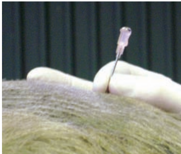
Figure 2: The hanging drop technique.

drop technique' (Figure 2 and Figure 3). Prior to injection, it is important to apply negative pressure to the syringe to ensure blood is not aspirated. If this occurs, the needle should be withdrawn slightly and the syringe re-aspirated. Injection into the epidural space should encounter no resistance.