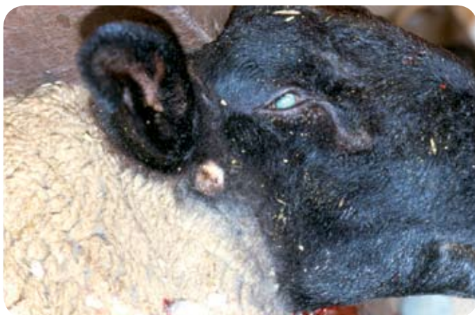
Figure 1: Corynebacterium pseudotuberculosis abscessation in parotid lymph node.

All sheep were necropsied using a standard protocol. An external examination of the carcass was carried out, noting any sinus discharges or subcutaneous swellings. The superficial and visceral lymph nodes, lungs and liver were then examined for abscessation. Suspect lesions were cultured for C. pseudotuberculosis (Cowan and Steel, 1974).