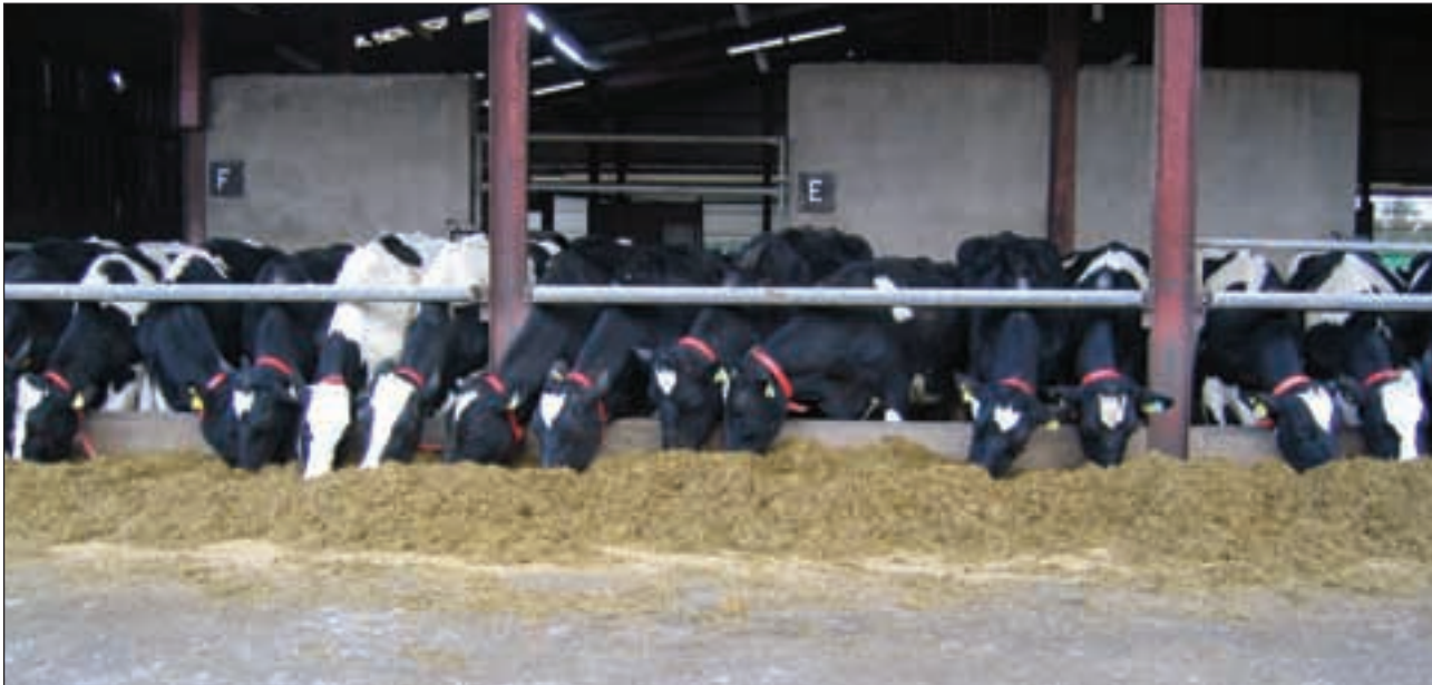
This study looked at the effect of restricting silage feeding on time of calving and calving performance in Holstein-Friesian cows.

regardless of feeding system. This reduction in nighttime calvings varied between two and 16 percentage units, by herd. The percentage of unassisted calvings did not differ between treatment groups ( P>0.05 ). Less calvings were recorded with slight assistance in the restricted group compared to the control group ( P<0.001 ). Cows with restricted silage access had a higher percentage of difficult calvings (11%) compared to the control cows (7%) ( P<0.001 ). Within the restricted group, there tended to be more dystocia during the day (12%) compared to the night (8%) ( P<0.10 ). In the control group, there was no difference in the dystocia rate between the day (7%) and the night (8%) ( P>0.05 ).